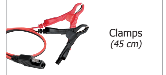
Clamps (45 cm)